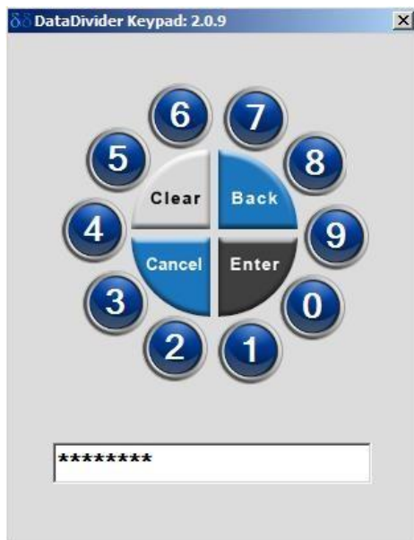
Figure 2 - DataDivider Virtual Keypad

The Virtual Keypad runs in DataDivider's PCI Level 1 Certified hosted environment. Access to the Virtual Keypad is through a Remote Desktop Protocol (RDP) session run under the protection and control of the DataDivider Protected Zone. The Virtual Keypad presents the agent with a circular rotary keypad where the digit zero is initialized in a random position. The only form of data entry on the Virtual Keypad is via mouse clicks on the agent desktop. On entry of each cluster of digits (i.e. every four digits for MasterCard and Visa cards) the Virtual Keypad randomly rotates clockwise or counter-clockwise 1 to 5 digits.